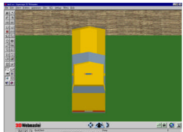
Fig.4 Force Feedback