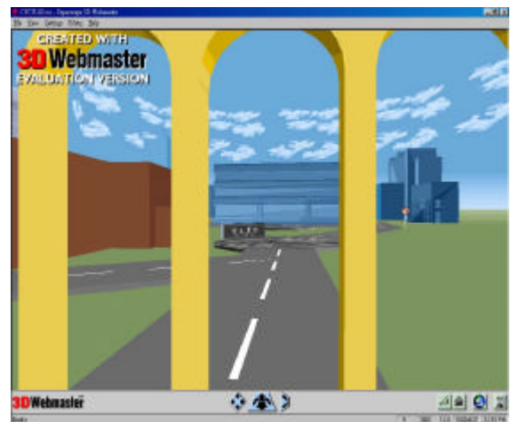
Fig.2 Visual Sign