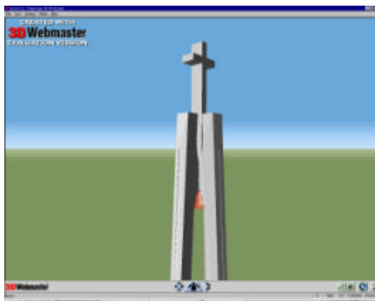
Fig.3 Audio Sound